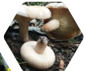
Lactifluus neotropicus